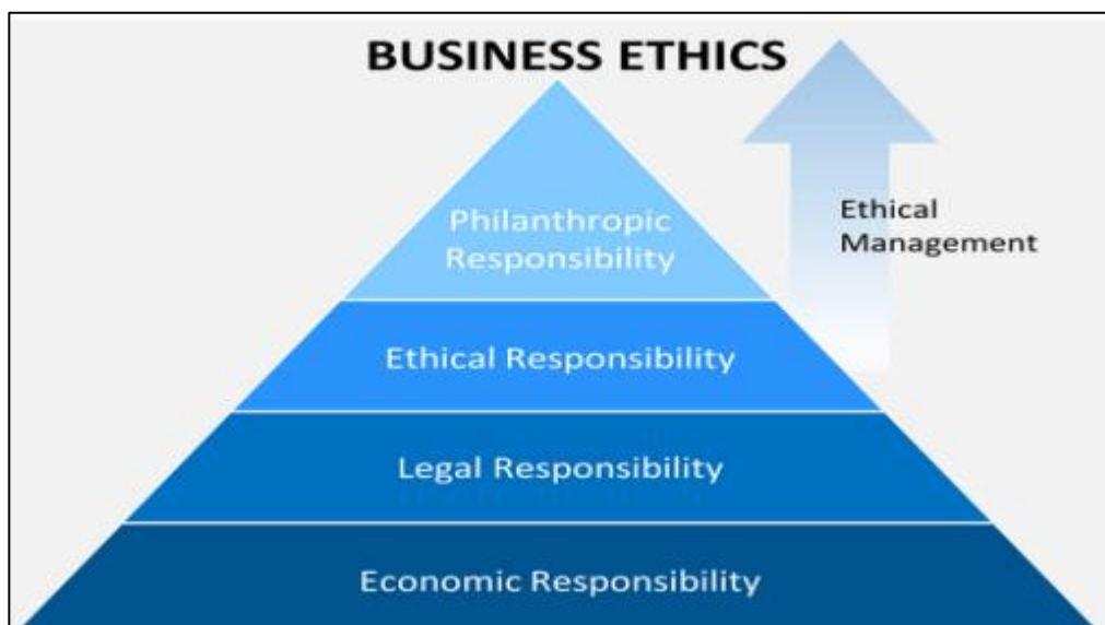
Figure 1: Pyramid Business Ethics [6]

The term "business ethics" refers to a kind of applied professional ethics that demonstrates the moral issues, moral standards, and moral objectives that emerge in a commercial environment. It is relevant to people organization and full management and can be applied to any or all aspects of business development. The ethical framework is derived from individuals, declarative statements, or the system.